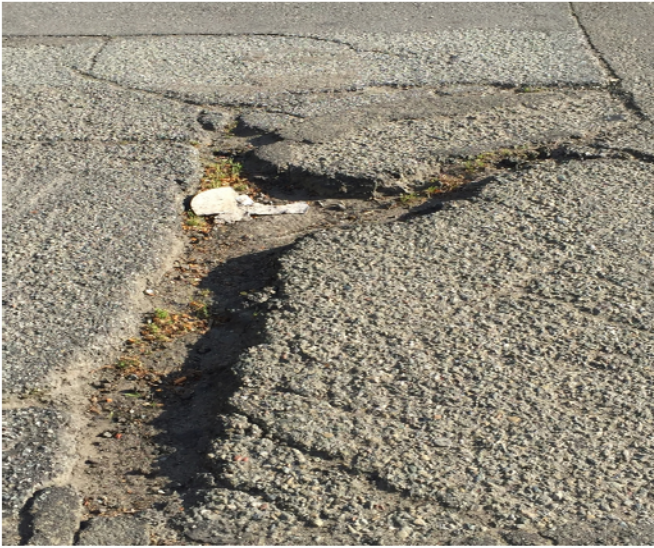
Strategy B Repair Potholes and Street/Sidewalk Damage from Trucks