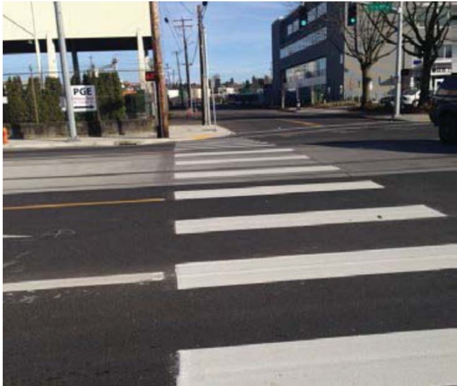
Strategy A Add a High-Visibility Crosswalk

Would any of these example strategies help with streets used by Port and OAB trucks? Please mark the locations on the maps with the strategies you recommend, or propose your own strategy.