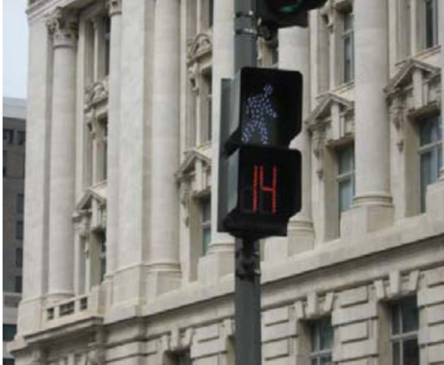
Strategy E Install Pedestrian Countdown Timers

Would any of these example strategies help with streets used by Port and OAB trucks? Please mark the locations on the maps with the strategies you recommend, or propose your own strategy.