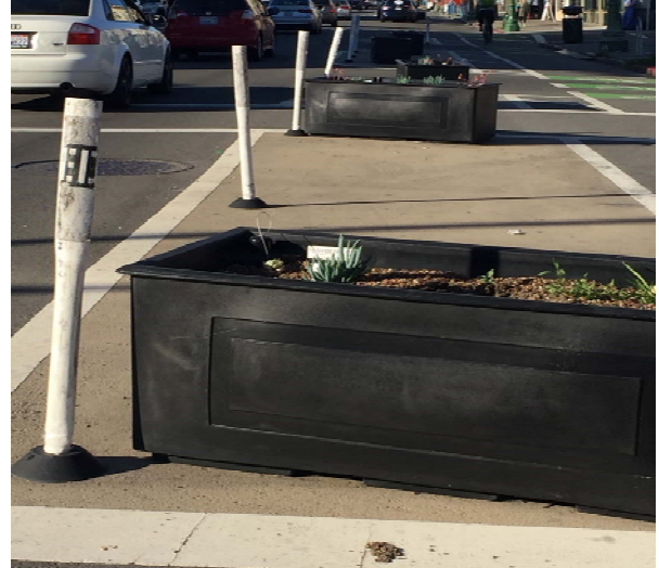
Strategy F Install Barriers between Roadway and Bike Path (example shown)