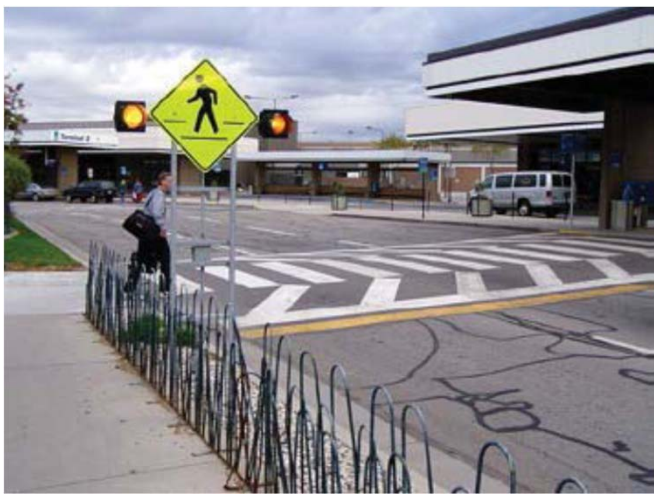
Strategy D Add a Raised Intersection/Pedestrian Crossing