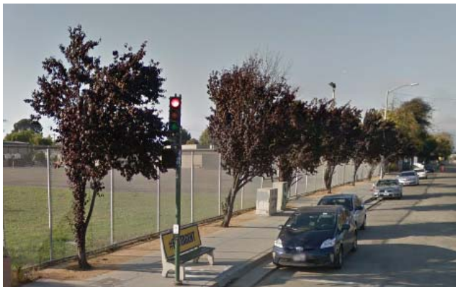
Strategy G Plant Vegetation for Partial Screening near Truck Businesses or Truck Routes

Other strategies? Please give us your suggestions below