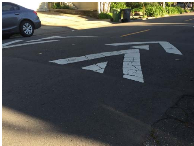
Strategy C Add a Speed Bump