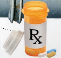
Dispose of medicines safely

! Do not flush unused prescription drugs or over the counter medicines. Visit www.ebmud.com/cleanbay for collection sites.