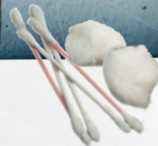
Cotton swabs & makeup pads