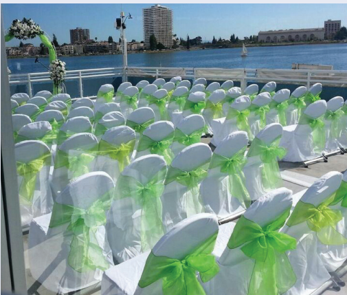
PHOTO DIRECTLY ABOVE: Green chair ribbons and a gorgeous arch of flowers await the bride, groom, and their guests with Lake Merritt providing the backdrop.