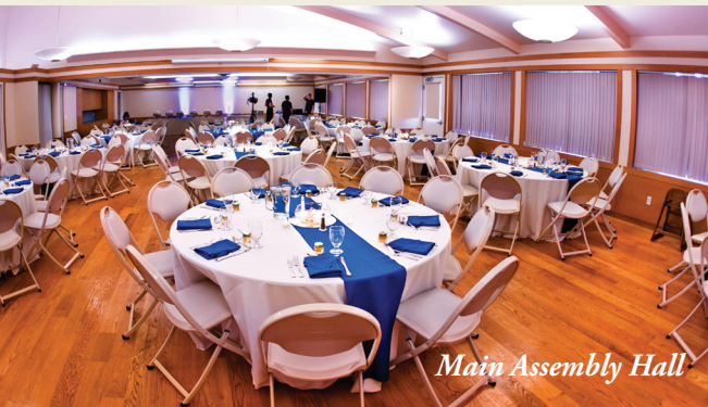
Main Assembly Hall