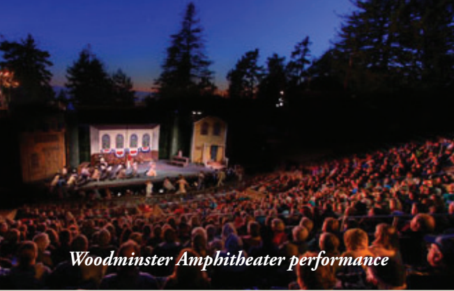
Woodminster Amphitheater performance