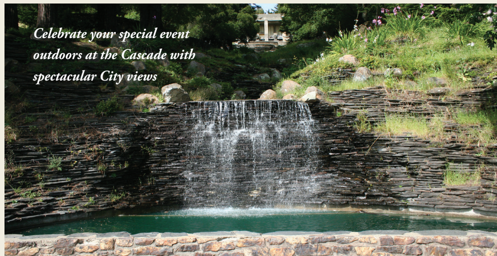
Celebrate your special event outdoors at the Cascade with spectacular City views

Visitors of the Park can wander for miles over sunny hillsides or shaded forest paths with plenty of parking and extensive picnic grounds.