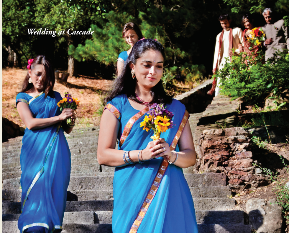
Wedding at Cascade