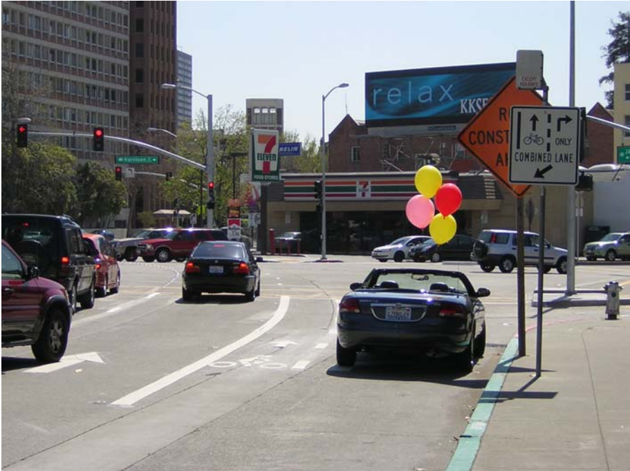
Photos, eastbound, approaching Harrison St