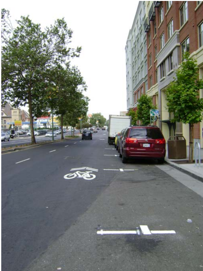
Comparable existing cross section, West Grand Ave (Telegraph Ave-Webster St)