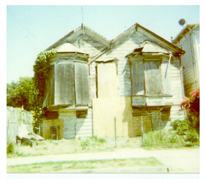
Example of Residential Rehab - Before

This program helps implement the City of Oakland's affordable housing development programs. City staff works with for-profit and non-profit developers to revitalize neighborhoods and increase housing opportunities through new construction, substantial rehabilitation and preservation of rental and ownership housing for very low-, low- and moderate income households.