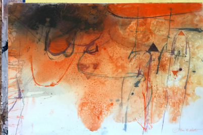
Painting by Myra M White

A rich opportunity to play with multiple dry & wet media in a comfortable setting. We will be working with acrylics, texture paste, graphite, dry pigments, soft pastels, collage and other media. This class is for continuing artists who have a collection of materials