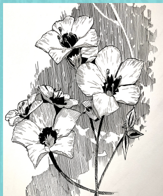
Drawing by Danny Neece

Interested in diving into the creative expression of drawing all things nature? During this 8 week course, students will learn the basics of pencil, pen, and ink drawing, and challenge their previous knowledge of the drawing medium. Topics discussed will include pencil and pen textures, hatching and cross hatching, inventive line quality, blending & shading, ink techniques, and expression in individual style. Engagement is the only requirement. By the end of the class, students will feel closer to the natural world, and confident in drawing anything under the sun.