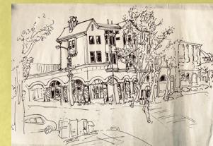
Drawing by Mokhtar Paki

Learn how to use pen/ink and gain confidence in creating bold contrast and strong image without fear. We will focus on the fundamentals of line style, shading, perspective and face & Figure drawing.