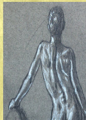
Drawing by Bill Roth

Gain greater confidence in your ability to compose and render the human form. This class provides an in-depth study of how to draw the human figure using live models. You will focus on basic proportions and proper construction of the human form as well as light and shadow, contour, line, and composition. In-class drawing exercises will be enhanced by demonstrations of how to simplify and assemble the more complex areas of the body. * Class fee includes $75 model fee