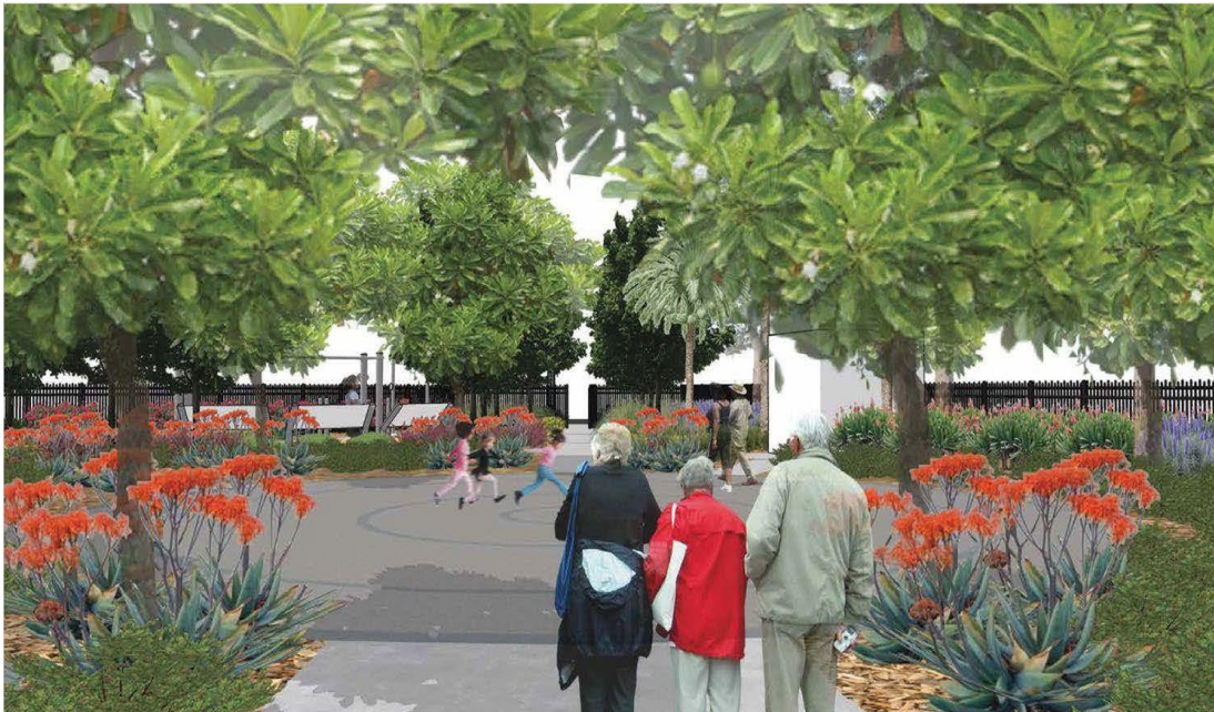
Tyrone Carney Park Conceptual Rendering.