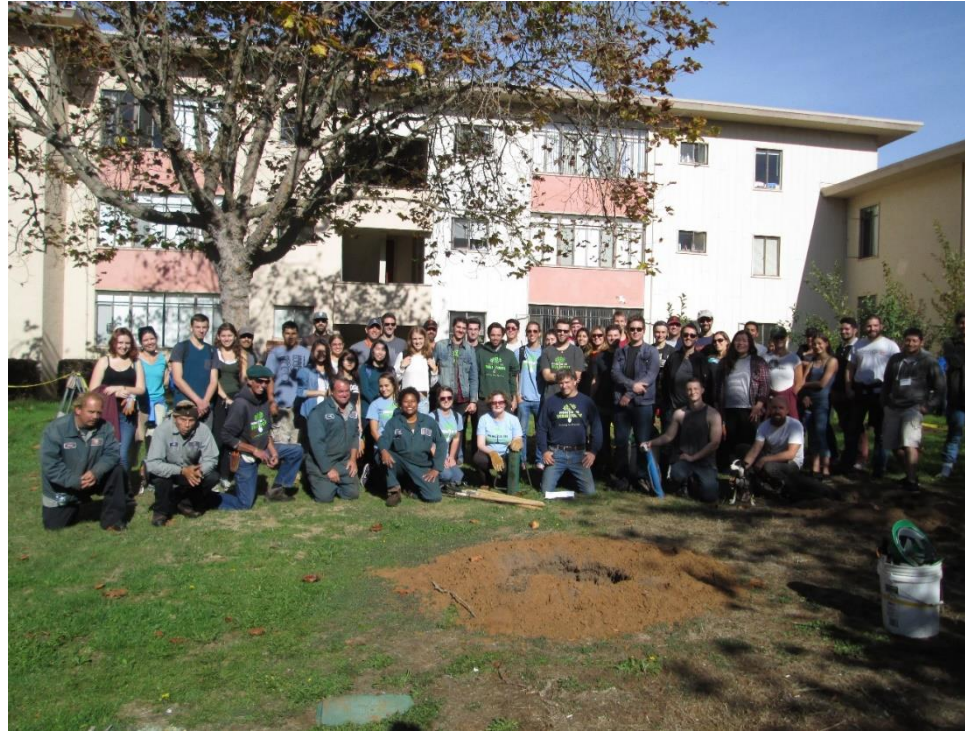
Fig. 2 Friends of the Urban Forest