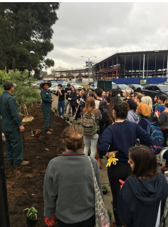
Fig. 1 Sol Patch Garden Community