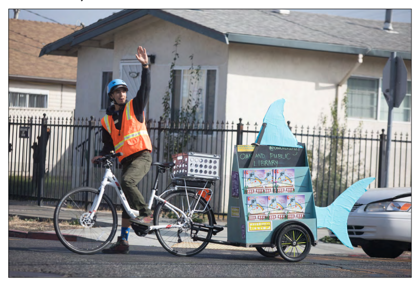
The OPL Bike Library on the move.

In October, the Oakland Public Library received a $15,000 grant from the Pacific Library Partnership to implement a "Recycle a Bicycle" program. Recycle a Bicycle is an earn-a-bike program for adults in East Oakland that will be implemented through a partnership with Cycles of Change, a