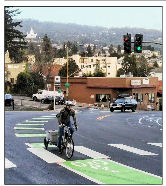
Green conflict zone, MacArthur Blvd at Canon Ave, makes complex intersection more visible.

community-based bicycle education organization. The grant will also fund the purchase of bike tools for checkout at OPL branches. Cycles of Change offers beginners' ride safety training, advanced bicycle adventures, bicycle restoration workshops, and environmental science programs in the East Bay. "Recycle a Bicycle" participants will learn basic bike riding and maintenance skills, get personalized route and riding guidance, and—upon successful completion of the program—earn a refurbished used bike, helmet, lock, and lights. Participants will also have the opportunity to teach the next cohort of participants, as OPL and Cycles jointly refine the curriculum and dynamically shape the Recycle a Bicycle program.