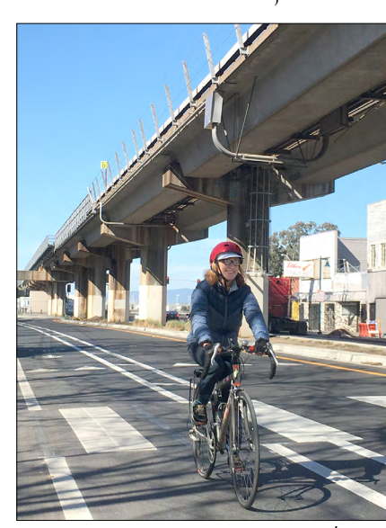
City staff inspects the new bike lanes on 7th St.

In August, buffered bike lanes included in Phase II of the 7<sup>th</sup> St West Oakland Transit Village Streetscape Project were completed. The new lanes between Wood and Peralta Streets extend the bike lanes installed as part of Phase I (Mandela Pkwy to Peralta St, 2012) west to Wood St by about 1/3 mile. In addition to bike lane striping, the project includes paving, high visibility crosswalks, and new/wider sidewalks, plus, still in construction, new trees and landscaping, pedestrian lighting, benches and trash cans, improved stormwater management, and walk-of-fame plaques to commemorate 7<sup>th</sup> Street's musical history as the "Harlem of the West," see everettandjones.com/saucy-sisters-blog/7th-street-oakland-walk-of-fame. A related paving project planned for completion in 2020 or 2021 will extend the bikeway east to Market St, installing mostly buffered bike lanes, replacing sharrows installed in 2012.