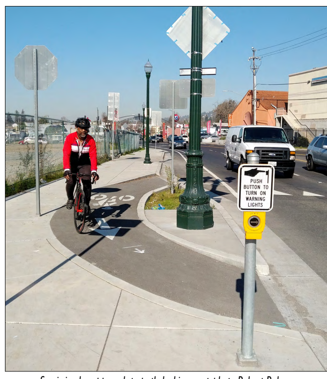
Semi-circular approach to path, looking west; photo Robert Raburn.

New features include crossing improvements at Richards Rd with a bike box and signage to guide southeast-bound bicyclists towards Seminary Ave and Millsmont. Bulbouts at the north side of the I-580 underpass narrow the crossing distance significantly, minimizing potential conflicts with motor vehicles. At the project's west end, the path starts with a semi-circular approach that angles bicyclists perpendicular to traffic for improved visibility to oncoming motorists. The adjacent sidewalk was widened and the addition of a center median safety island narrowed the street and