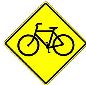
MUTCD W11-1 Sign

NOTE: UNLESS OTHERWISE SPECIFIED ON PLANS, THE LAYOUT OF BIKE LANE INTERSECTION MARKINGS SHALL CONFORM TO THE FOLLOWING: