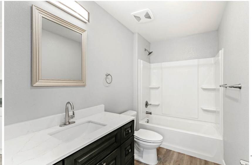
Photos of a model home