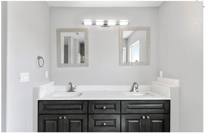
Photos of a model home