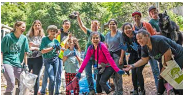
Volunteers pitch in on Earth Day, 2019

Visit tinyurl.com/CourtlandCreek for more information and Project updates.