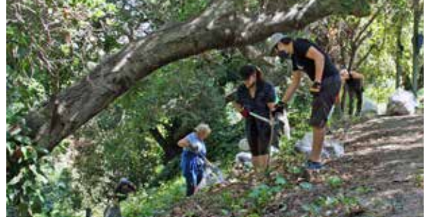
Volunteers clean up Courtland Creek Park, June 2021