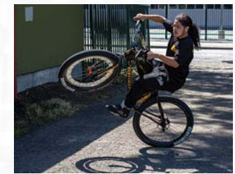
Scraper Bike Ride - Part 1