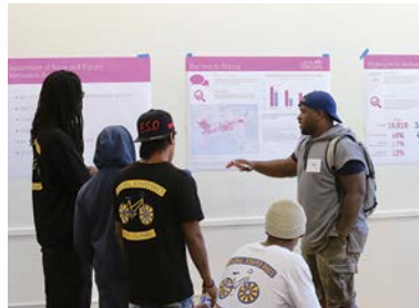
Let's Bike Oakland Design Lab