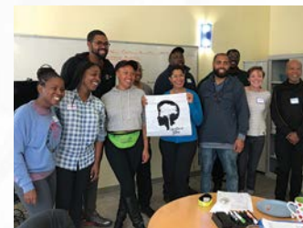
Left: Bikes4Life-hosted Workshop doorhanger; Right: Outdoor Afro-hosted Workshop