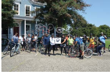
Outdoor Afro West Oakland Bike Tour