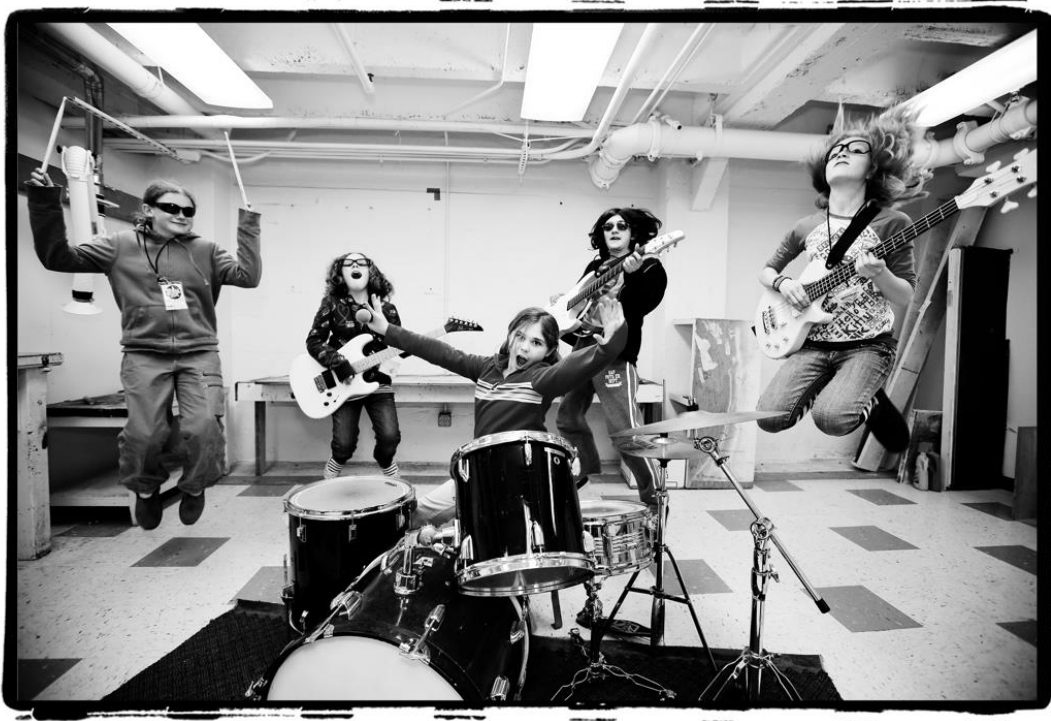
Bay Area Girls Rock Camp, Organization Project Grant Recipient