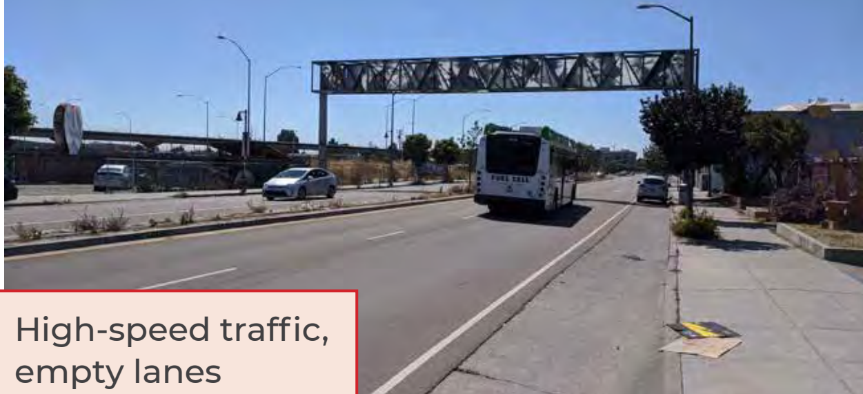
High-speed traffic, empty lanes