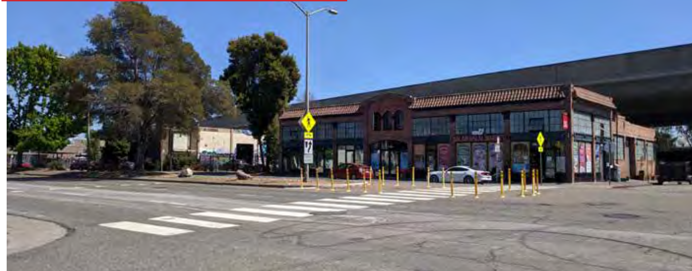
Crosswalk improvements with temporary materials