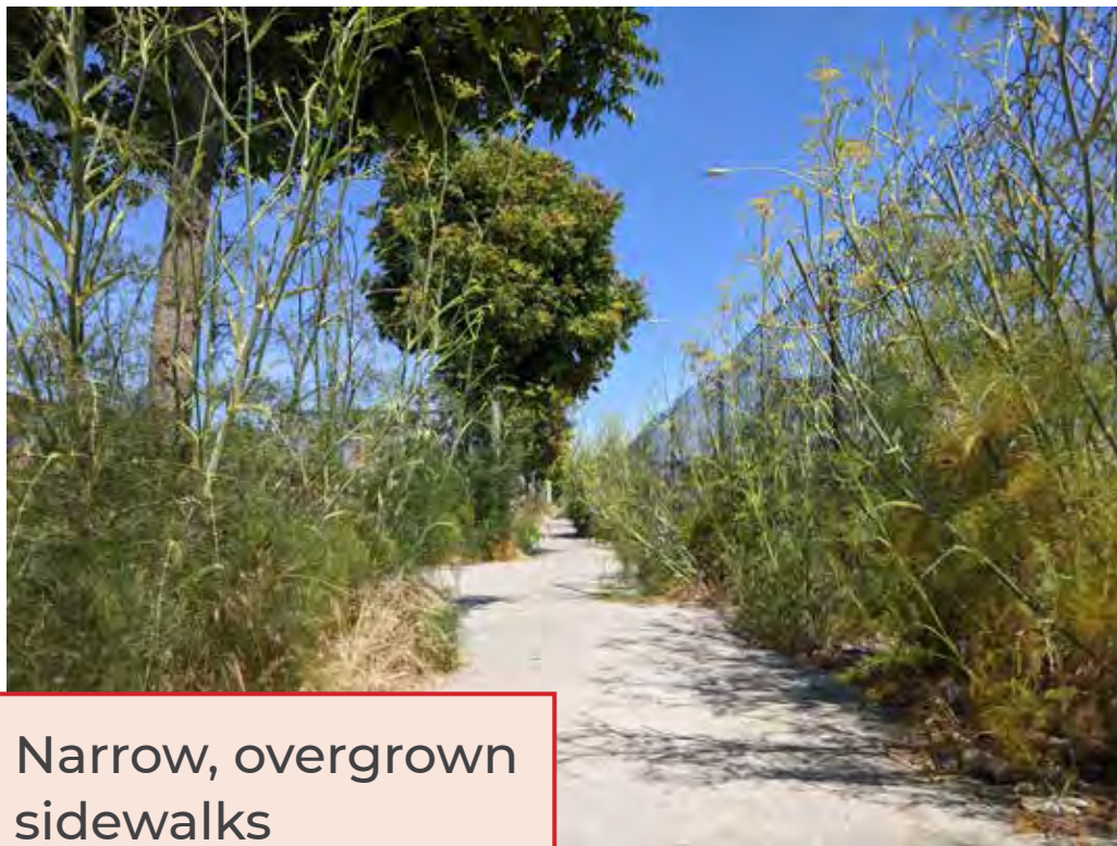
Narrow, overgrown sidewalks