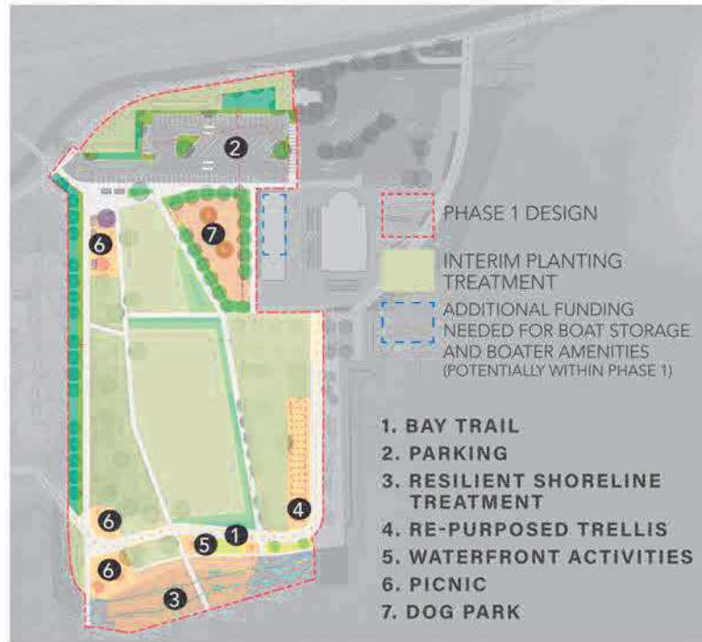
PHASING CONCEPT 2