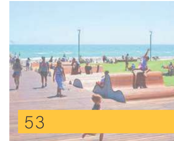
Active plaza areas for larger groups