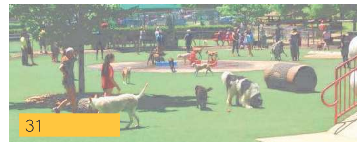
Turf with fewer forms and play structures