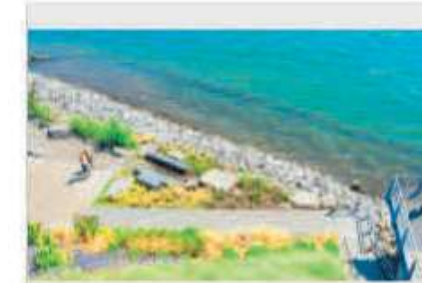
Boulder shoreline + usable areas