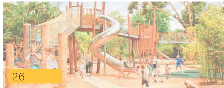
Large play structure for larger groups