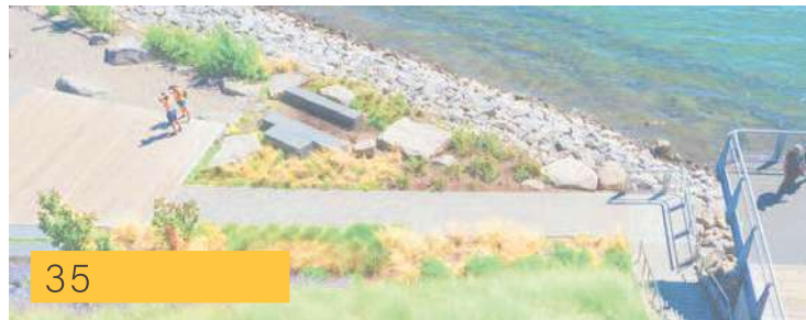
Boulder shoreline with usable areas above.