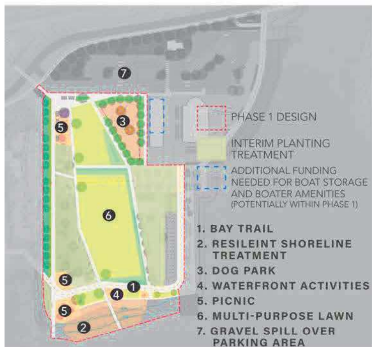
PHASING CONCEPT 3