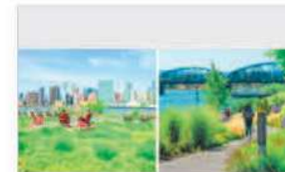
Seating + paths for smaller groups