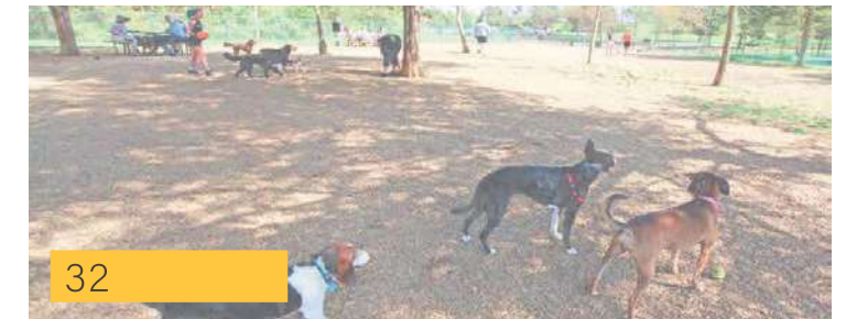
Large mulch open area for larger dogs