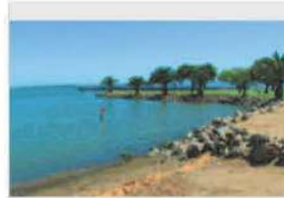
Fine gravel shoreline + boulders