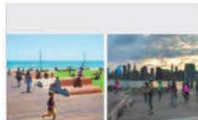
Active plazas for larger groups