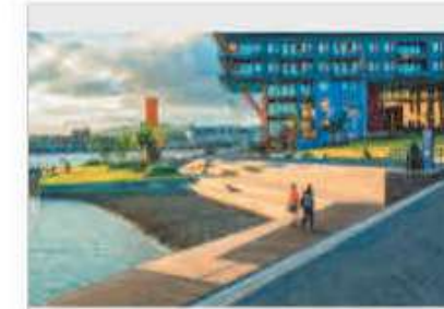
Coarse gravel shoreline + seating