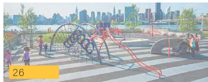
Structured play areas