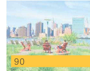
Seating areas and paths for individuals and smaller groups