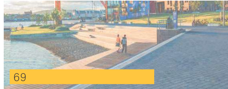
Coarse gravel shoreline with seating