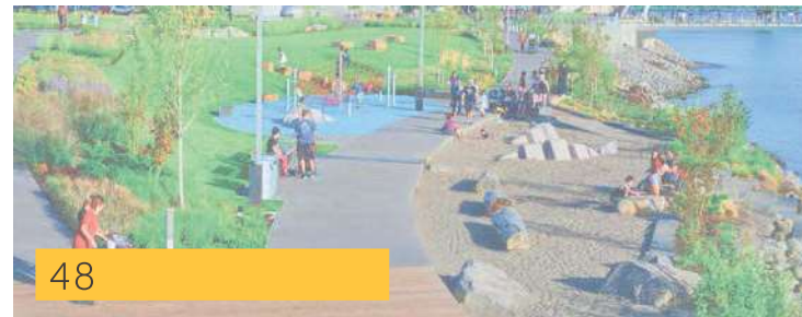
Smaller, more dispersed play area