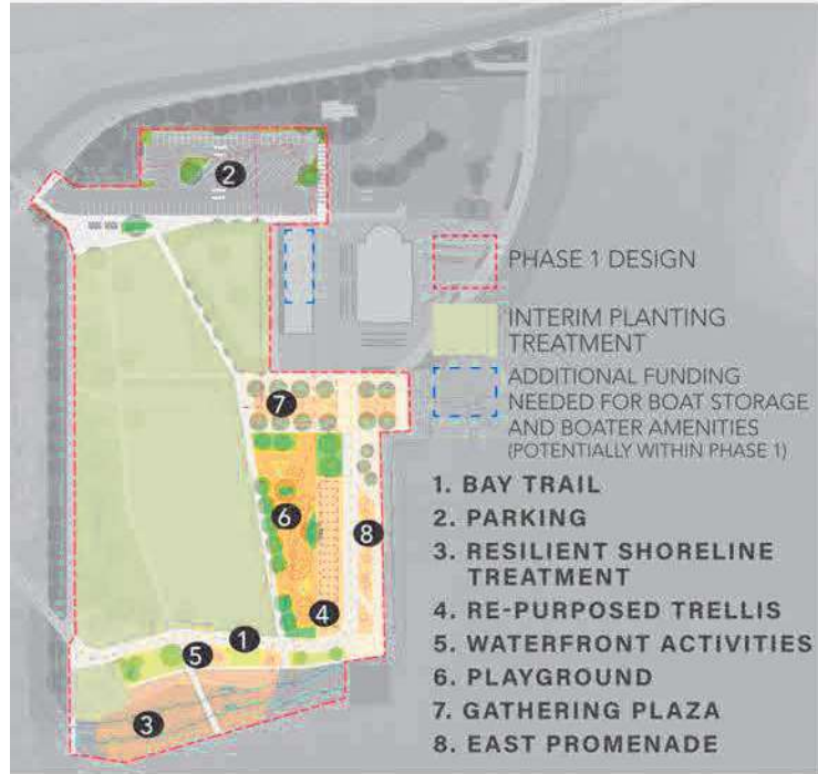
PHASING CONCEPT 1