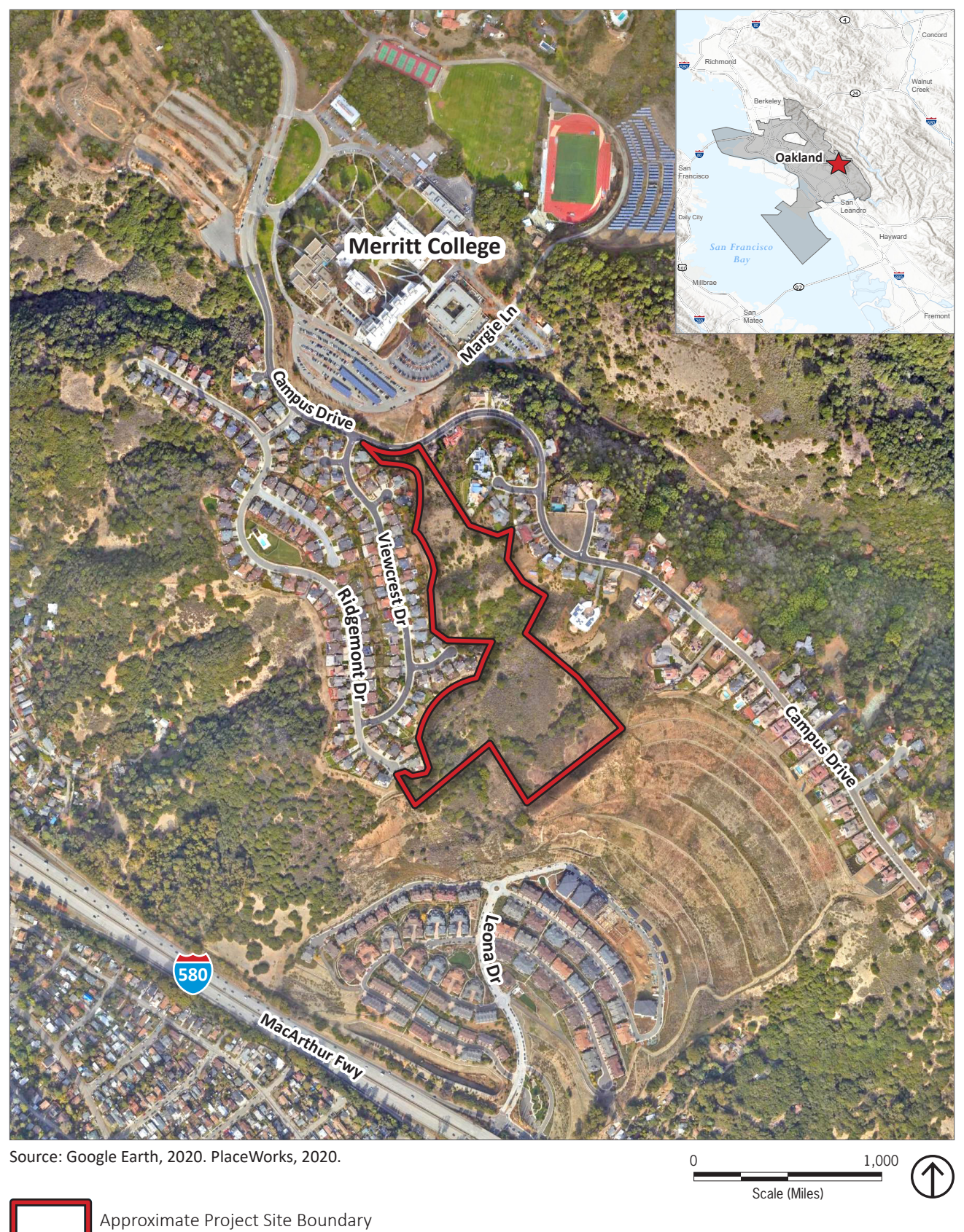
Figure 1 Project Site and Local Vicinity